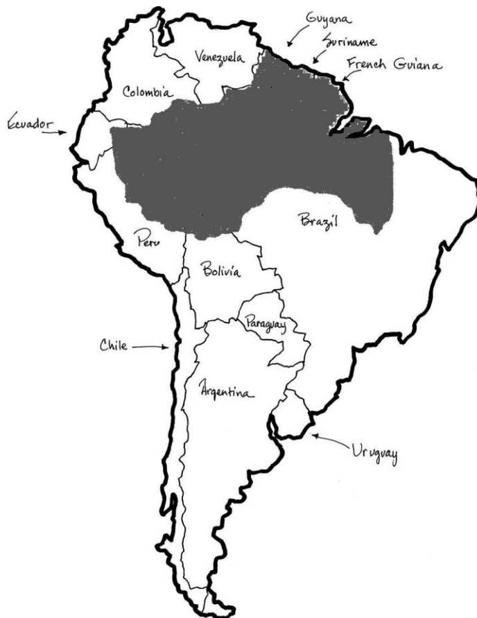
Figure 1. The distribution of the Blue and Gold Macaw in South America.

A Guide to Macaws (2003), Macaws. A Complete Pet Owner's Manual (2002), The Large Macaws (1995)