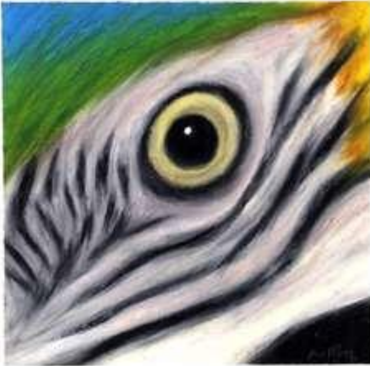
"Macaw eye". Illustration by Paul Plante